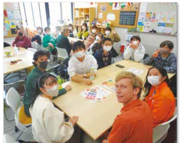
Lunch Talk ランチトーク