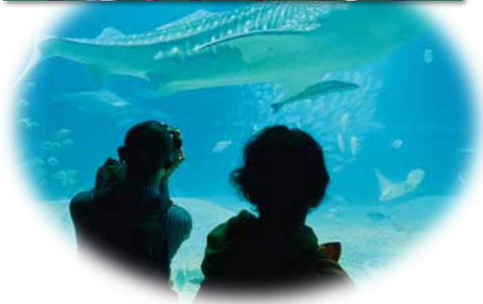
Osaka Aquarium Kaiyukan 海遊館