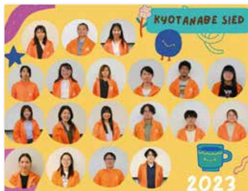
SIED Kyotanabe Campus / 京田辺キャンパス

SIED (Student Staff for Intercultural Events at Doshisha)