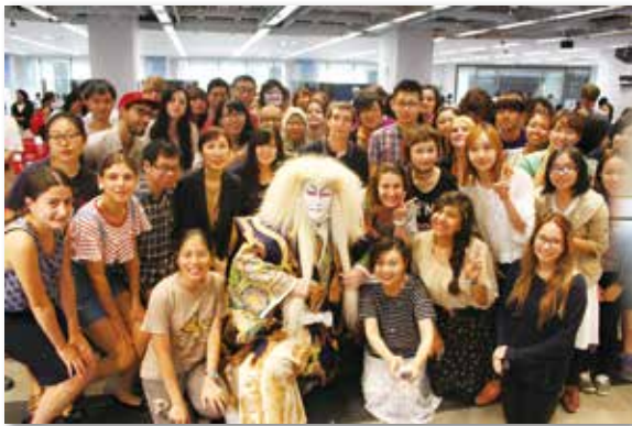
Kabuki Workshop 歌舞伎ワークショップ