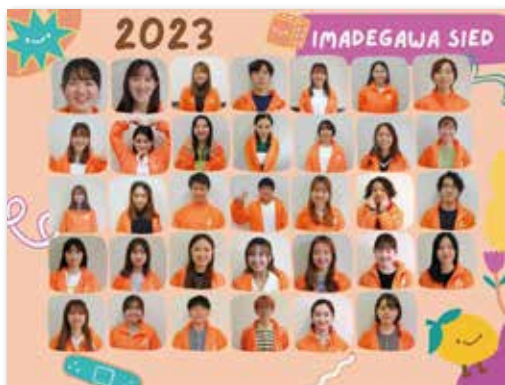
SIED Imadegawa Campus / 今出川キャンパス