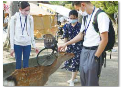
Nara Prefecture day trip 奈良県日帰り旅行