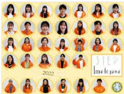
SIED Imadegawa Campus / 今出川キャンパス