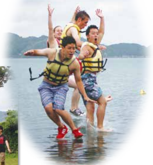
MIX camp ミックスキャンプ