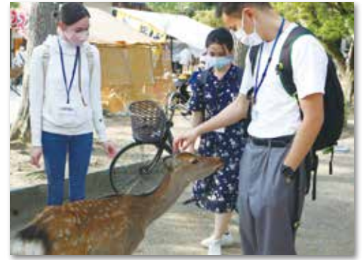
Nara Prefecture day trip 奈良県日帰り旅行