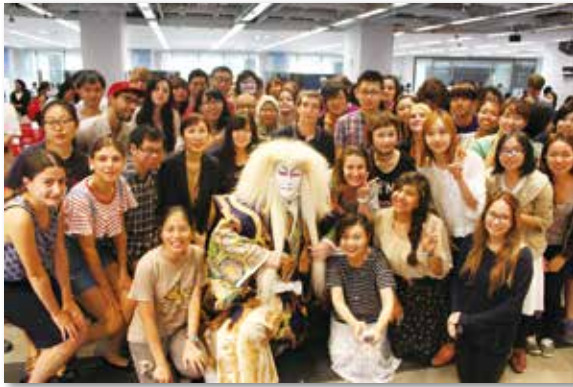
Kabuki Workshop 歌舞伎ワークショップ