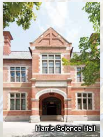
Harris Science Hall