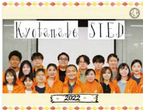
SIED Kyotanabe Campus / 京田辺キャンパス

SIED (Student Staff for Intercultural Events at Doshisha)